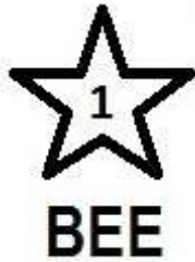
Fig 6.3: Sample label on the Name plate of one star Ballast

The actual dimension of the star label of Ballast to be engrossed on the name plate of the Ballast is shown in figure 6.4.