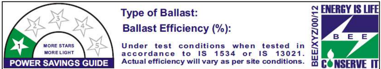
Figure 6.1: Sample Label of Ballast

6.1. The energy star label shall be displayed on the packaging as shown in Fig. 6.1. The other details shall be marked as given in relevant Indian standards both on the product as well as on the packaging/card board cartons.