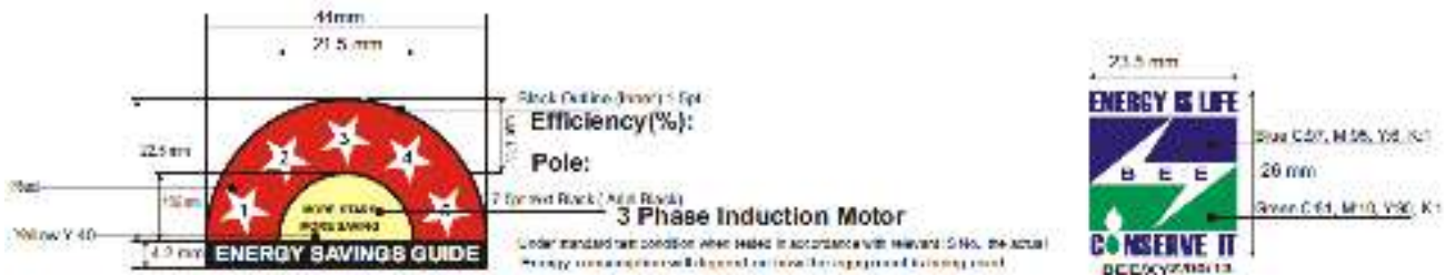
Figure 1: Design Scheme of Label (sample)

10.1 Detailed label specifications (size, colour scheme, font size, security features, etc), content of the label (parameters displayed on the label) is provided below. The dimensions of the label can be proportionally reduced with respect to the size of the motor, but should be prominently visible.