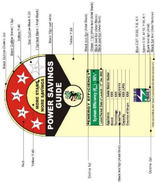
Figure 1 Label for SWH system